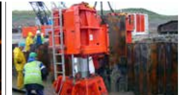
Specialist Work >