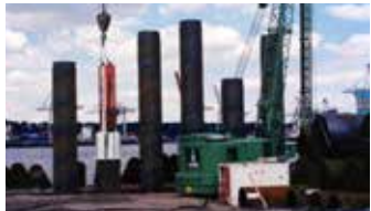
Harbour / River Work