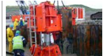
Specialist Work >